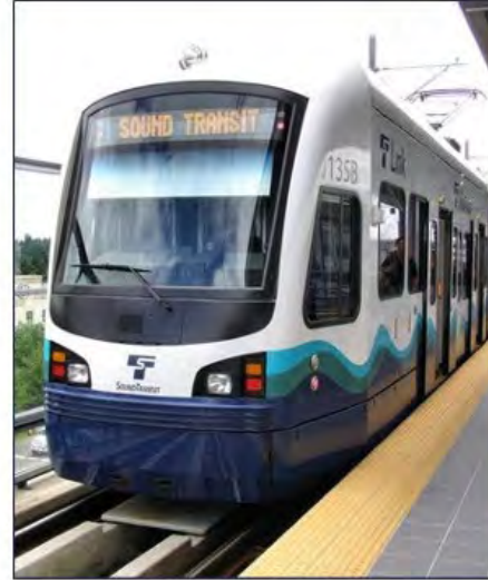
Series 1 LRV

The scope of the Series 3 LRV project will include all steps necessary to specify, procure, manufacture, commission, and accept new vehicles over 13 years (2023 – 2036), with an option to extend the base LRV order beyond this 13-year period by executing options for additional vehicles as outlined in the contract.