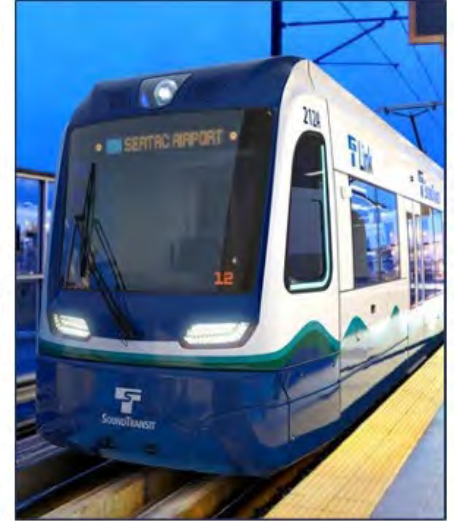
Series 2 LRV